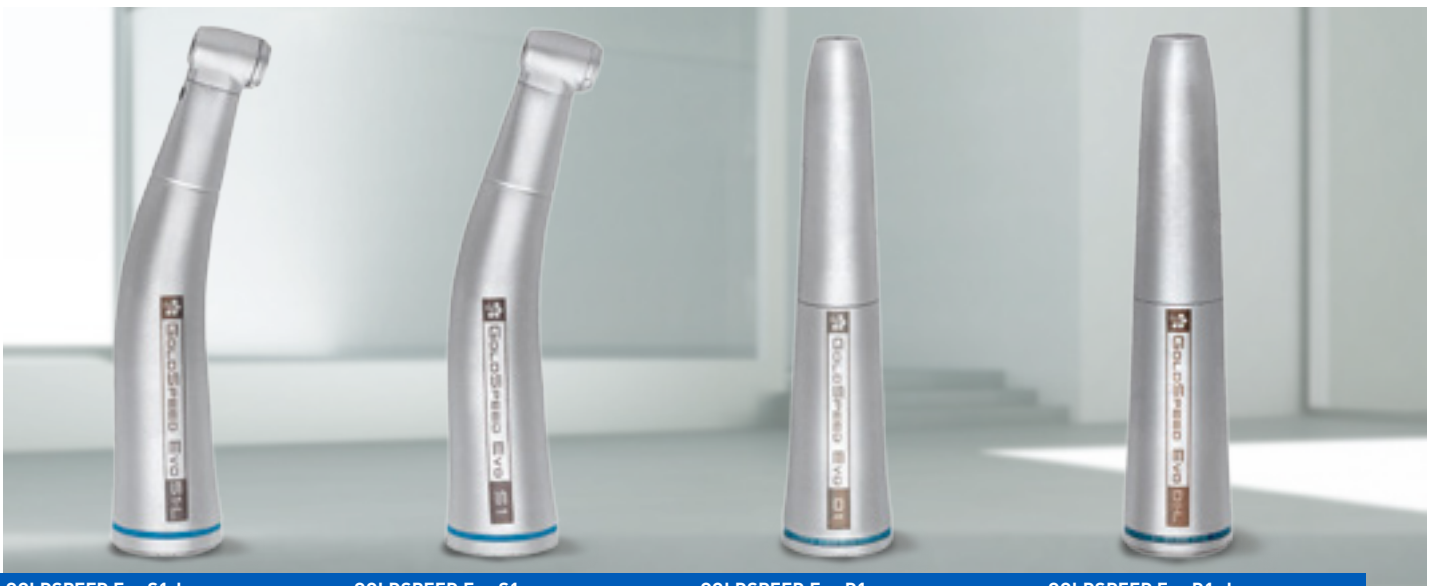
GOLDSPEED Evo S1-L (1:1) Conservative

For conservative, prosthetic and general dentistry. Multiplier contra-angle handpiece, gear ratio 1:5, can be heat-disinfected and sterilised in an autoclave, uses \varnothing 1.6 mm FG burs, push-button bur lock, quadruple spray, ceramic ball bearings, integrated high-intensity, autoclave-safe fibre optic lighting. Head diameter 10 mm.