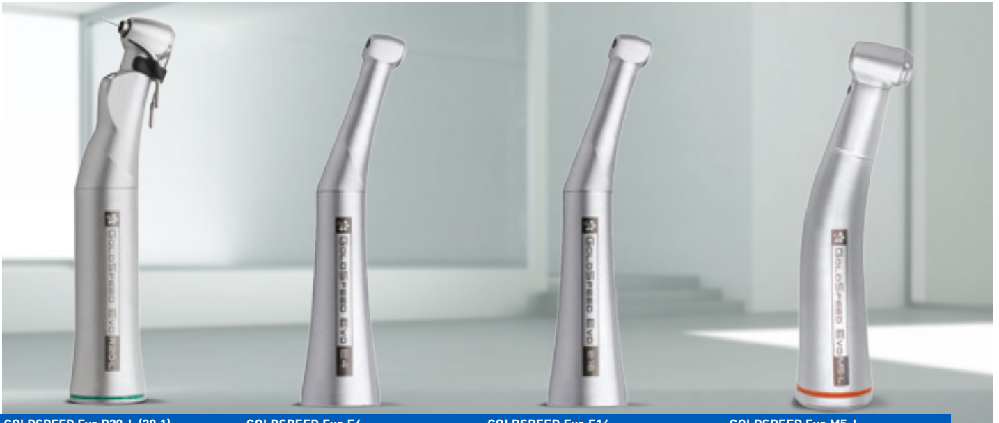
GOLDSPEED Evo R20-L (20:1) Surgical use, Implantology, Osteotomy

Specifically for surgical use, gear ratio 20:1, can be heat-disinfected and sterilised in an autoclave, can be disassembled for thorough cleaning, single spray, with hex-type tightening system, for burs and surgical instruments with contra-angle stem \varnothing 2.35 mm, internal Kirschner/Meyer cooling system and external spray, LED with incorporated generator.